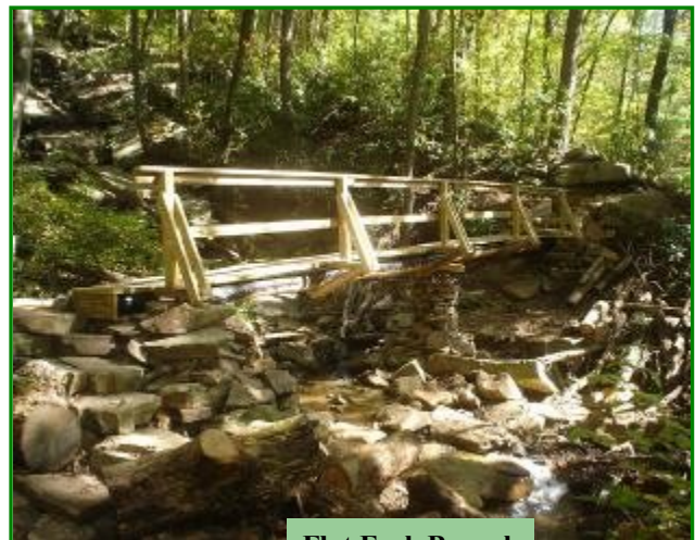
Flat Fork Branch