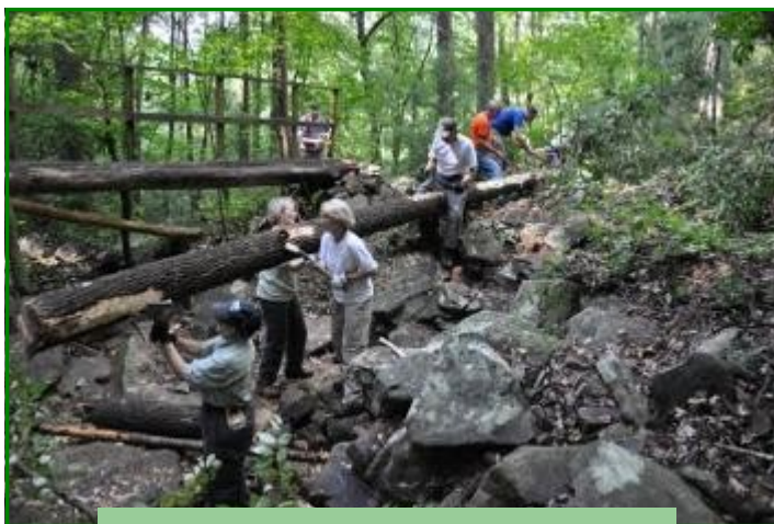
CTC volunteers remove bark from the trees that will be utilized for the pole bridges